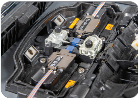
Wind Protector Open